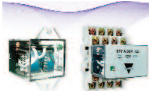
10A 3PDT / 10A 4PDT LED Indication (Plug Mount Only)